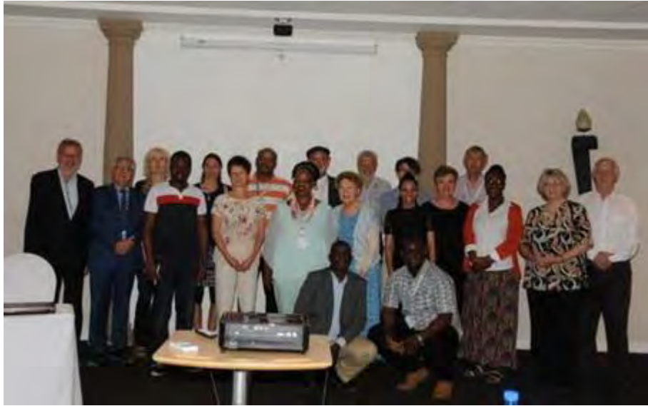
The group of participants