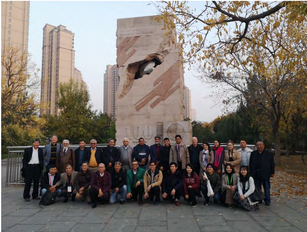
Group photo of AGA colleagues in front of the Monument to the 100th Anniversary of the Geographical Society of China, Tianjin