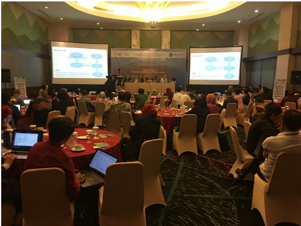
Opening ceremony at the IPB International Convention Center, Bogor, Indonesia